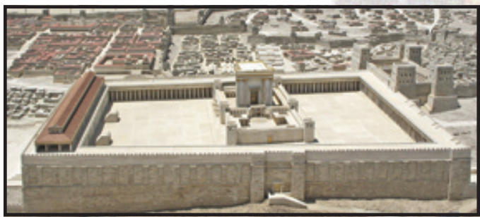
Model of the Second Temple of Jerusalem, built by 515 B.C

The Pharisees emerged as a distinct group shortly after the Maccabaean revolt, around 165-160 B.C. They are thought to be spiritual descendants of the Hasideans. The Pharisees were a party of laymen and scribes and very different to the Sadducees, (the party of the high priesthood that had traditionally provided the sole leadership of the Jewish people). Around 100 B.C., a long struggle began as the Pharisees tried to make the Jewish religion more of a democracy and remove it from the control of the Temple priests. The basic difference, that led to the split between the Pharisees and the Sadducees, lay in their different attitudes toward the Torah (the first five books of the Old Testament) and the problem of finding in it answers to questions about legal and religious matters in the circumstances of their day, which were far different from those of the time of Moses.