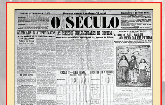
The local masonic newspaper "O Seculo" even reported the occurrence of the miracle!