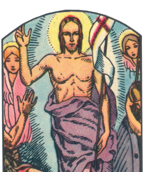
11. The Resurrection of Jesus

REMEMBER THE WORDS OF OUR LADY AT FATIMA: "Pray the Rosary daily!"