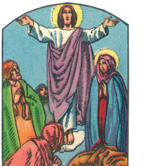
12. The Ascension of Jesus

LESSONS FROM THIS MYSTERY Overcoming the fear of publicly practicing our Faith; Perseverance in our spiritual duties and prayers; Great devotion to the Holy Ghost; Intense zeal for the conversion of souls and spreading of the Faith; Allowing the Holy Ghost to rule and guide us through the Seven Gifts of the Holy Ghost.