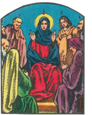
13. The Descent of the Holy Ghost

LESSONS FROM THIS MYSTERY Overcoming the fear of publicly practicing our Faith; Perseverance in our spiritual duties and prayers; Great devotion to the Holy Ghost; Intense zeal for the conversion of souls and spreading of the Faith; Allowing the Holy Ghost to rule and guide us through the Seven Gifts of the Holy Ghost.