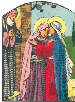
2. The Visitation to St. Elizabeth

LESSONS FROM THIS MYSTERY Charity towards others in spite of personal difficulty; Faith; Hope; Bringing Jesus to others; Seeing God's work in others; Devotion to Our Lady's "Magnificat"; Peace of soul in face of suspicion or false accusations; Holiness produces holiness—we cannot give to others what we do not have ourselves.