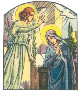
1. The Annunciation to Our Lady

LESSONS FROM THIS MYSTERY Acceptance of God's Will; Humility; Faith; Hope; Charity towards God; Purity; Living a quiet retired life; Cooperation with Angels; Devotion to the "Hail Mary"; Prayerfulness; Letting the Holy Ghost into our life; Listening to God's inspirations.