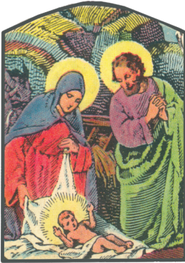
3. The Nativity of Jesus Christ

LESSONS FROM THIS MYSTERY Obedience to lawful authority in valid commands; Acceptance of suffering to bring about God's Will & Providence; Love of Poverty; Making the best out of whatever situation we find ourselves in; Finding God in Poverty; Accepting rejection, or failure and difficulties; Seeing God's Will in all things.