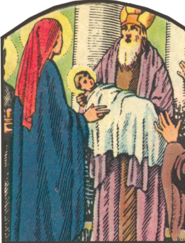
4. The Presentation in the Temple

LESSONS FROM THIS MYSTERY Obedience to the liturgical rites and laws of the Church; Putting our Faith and religious observances ahead of worldly occupations & pleasures; Acceptance the "Swords of Sorrow" of our life; the offering ourselves to the service of God; Purifying from sin and bad habits by means of Prayer & Penance.