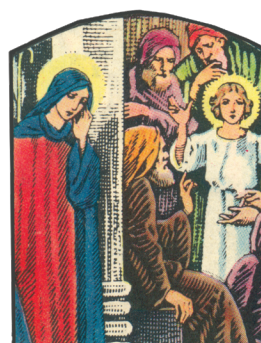
5. The Finding of Jesus in the Temple

LESSONS FROM THIS MYSTERY Putting the "Father's Business" before our own interests and profit; Seeking to learn, know & understand more about our Faith; Not being afraid to talk about the things of God; Not being afraid to correct others in matters of Faith & Morals; Seeking Jesus above all things.