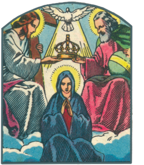
15. The Coronation of Our Lady

LESSONS FROM THIS MYSTERY A great and true devotion to Mary; making and living the consecration to Mary as taught by St. Louis de Montfort; Devotion to both the Sorrowful and Immaculate Heart of Mary; Spreading the practice of a true devotion to Mary to others.