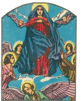
14. The Assumption of Our Lady

LESSONS FROM THIS MYSTERY Preparing for a good and holy death by a good and virtuous life and a good use of the Sacraments and Sacramentals of the Church; Practicing the "Communion of Saints" by a frequent recourse to the souls in Heaven and Purgatory; Praying for those who have died and are in Purgatory.