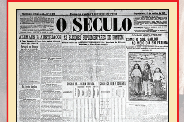
The local masonic newspaper "O Seculo" even reported the occurrence of the miracle!

The masonic newspaper "O Seculo" editor saw and wrote of the miracle.